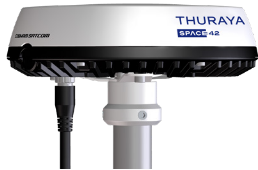
Mast mounted Orion NEO Maritime Antenna