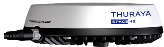
Voyager NEO with hybrid power and ethernet cable